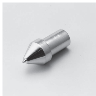
HTX-11 to HTX-14