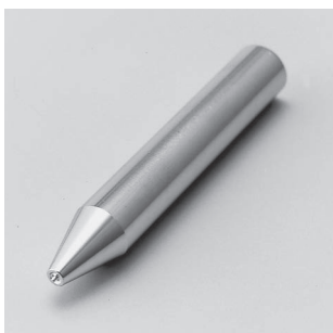
HTX-1 to HTX-6