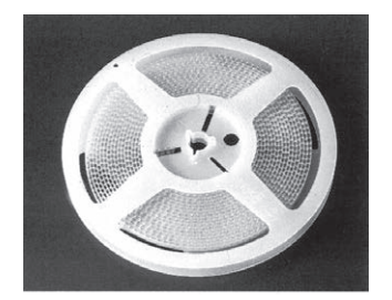
HK-3- \square -T(tape-and-reel)