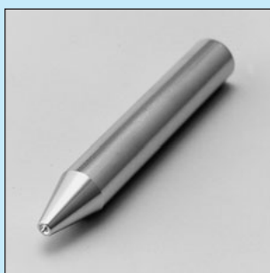
HTX-1 to 6