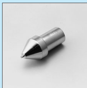
HTX-11 to 14